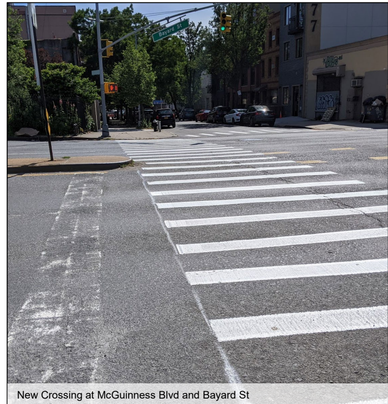
New Crossing at McGuinness Blvd and Bayard St