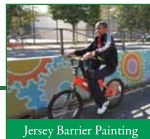
Jersey Barrier Painting