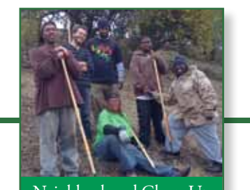
Neighborhood Clean-Up Projects